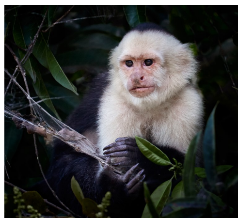
Costa Rica - Winning the Conservation battle

It can be difficult to get decent images in the country due the often dense vegetation and tricky light conditions, so some of the images are not high quality. But hopefully this will give you a flavour of what can be seen. If you have already been to the country it may bring back some good memories. If you haven't then add it to your bucket list as and when this might be possible.